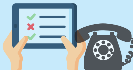
Health Referral system to be followed