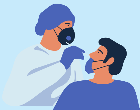
Conduct Regular Screening

In case children or staff at the CCI show any symptoms like fever, cough and shortness of breath the Persons in Charge of CCIs shall ensure these measures: