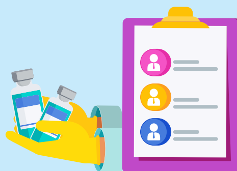
Planning in advance for emergency situations.